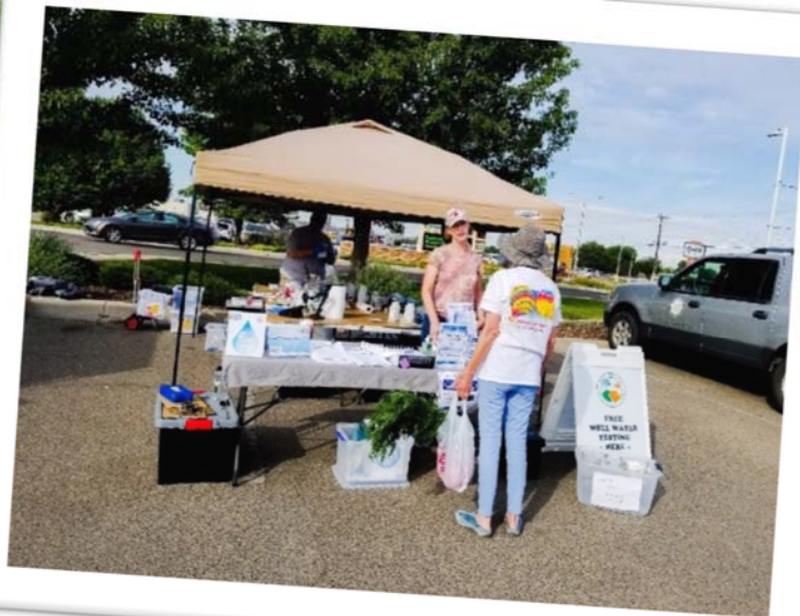
Right: Ground Water Quality Bureau staff provide free well water testing services around the State; Farmington Water Fair pictured, August 2019