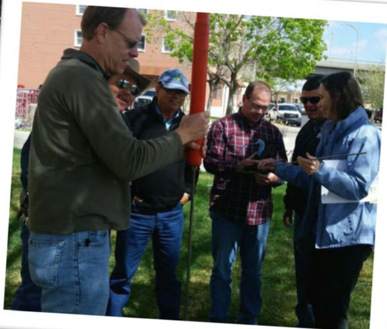
Right: Solid Waste Bureau demonstrates proper landfill methane monitoring techniques, April 2019