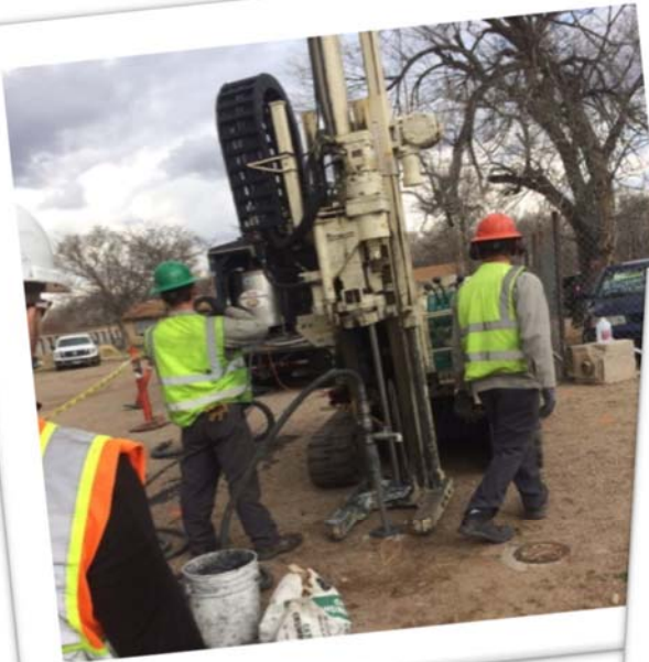
Left: Petroleum Storage Tank Bureau expedites the remediation of a tank release site in Belen, May 2019.