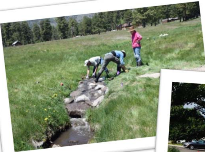
Left: Surface Water Quality Bureau supporting the La Jara Creek River Stewardship Program project to re-wet at least 65 acres of historic wetlands in the Valles Caldera National Preserve, June 2019