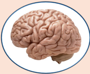
DAMAGE TO BRAIN AND NERVOUS SYSTEM

Lead is harmful to everyone, but because their bodies and brains are still developing, children are especially vulnerable to lead exposure.