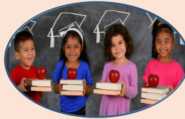
LEARNING AND BEHAVIOR PROBLEMS