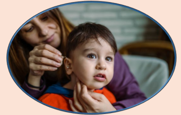
HEARING AND SPEECH PROBLEMS