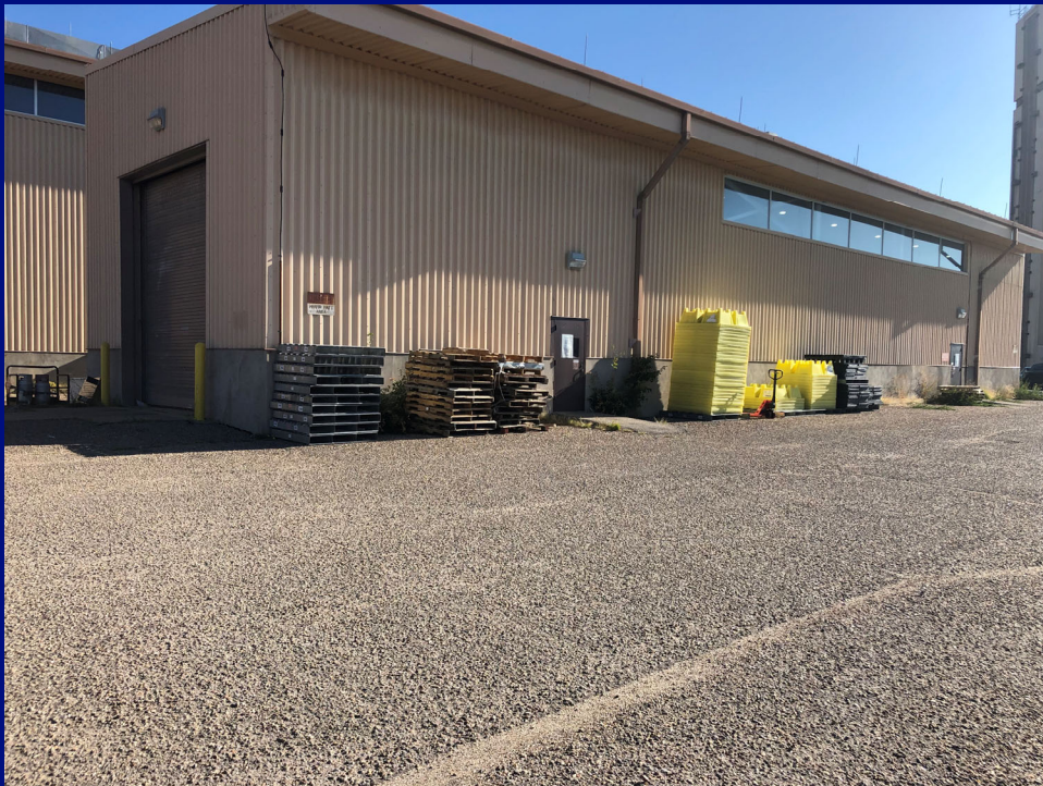
Outside the southern portion of TA-60-0017