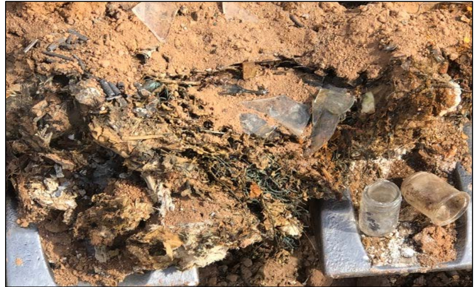
Materials Found by DOE