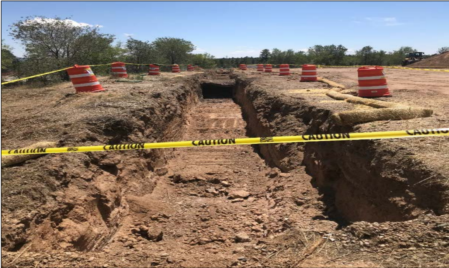
A-8-B utility trench north end looking south.