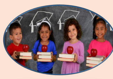
LEARNING AND BEHAVIOR PROBLEMS