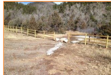
Pecos River Respect the Rio program encourages river-friendly camping