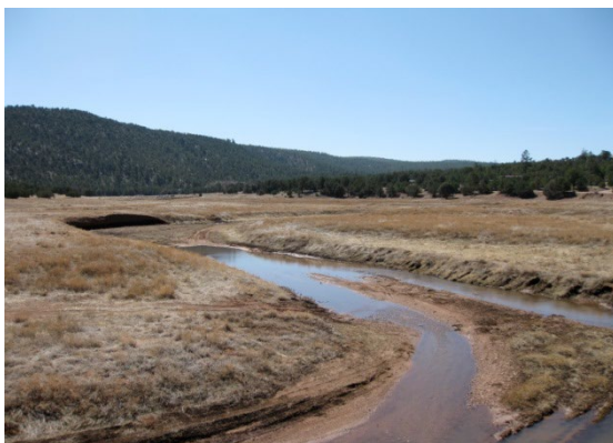
Bluewater Creek (2009)

https://www.env.nm.gov/surface-water-quality/watershed-protection-section/