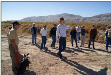
Lower Rio Grande Paso del Norte Watershed Council evaluates Selden Drain