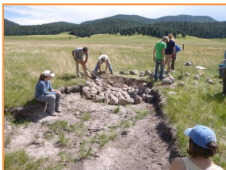
San Antonio Creek Volunteers treat a gully on the Valles Caldera National Preserve

$100,000 per year in federal Section 319 funds are available to support watershed-based planning. Approximately $500,000 per year are available to support implementation.