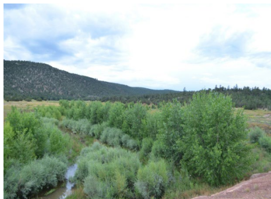
Bluewater Creek after restoration

NMED does not discriminate on the basis of race, color, national origin, disability, age or sex in the administration of its programs or activities. To learn more, or file a complaint, go to www.env.nm.gov/general/environmental-justice-in-new-mexico .