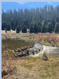
San Antonio Creek