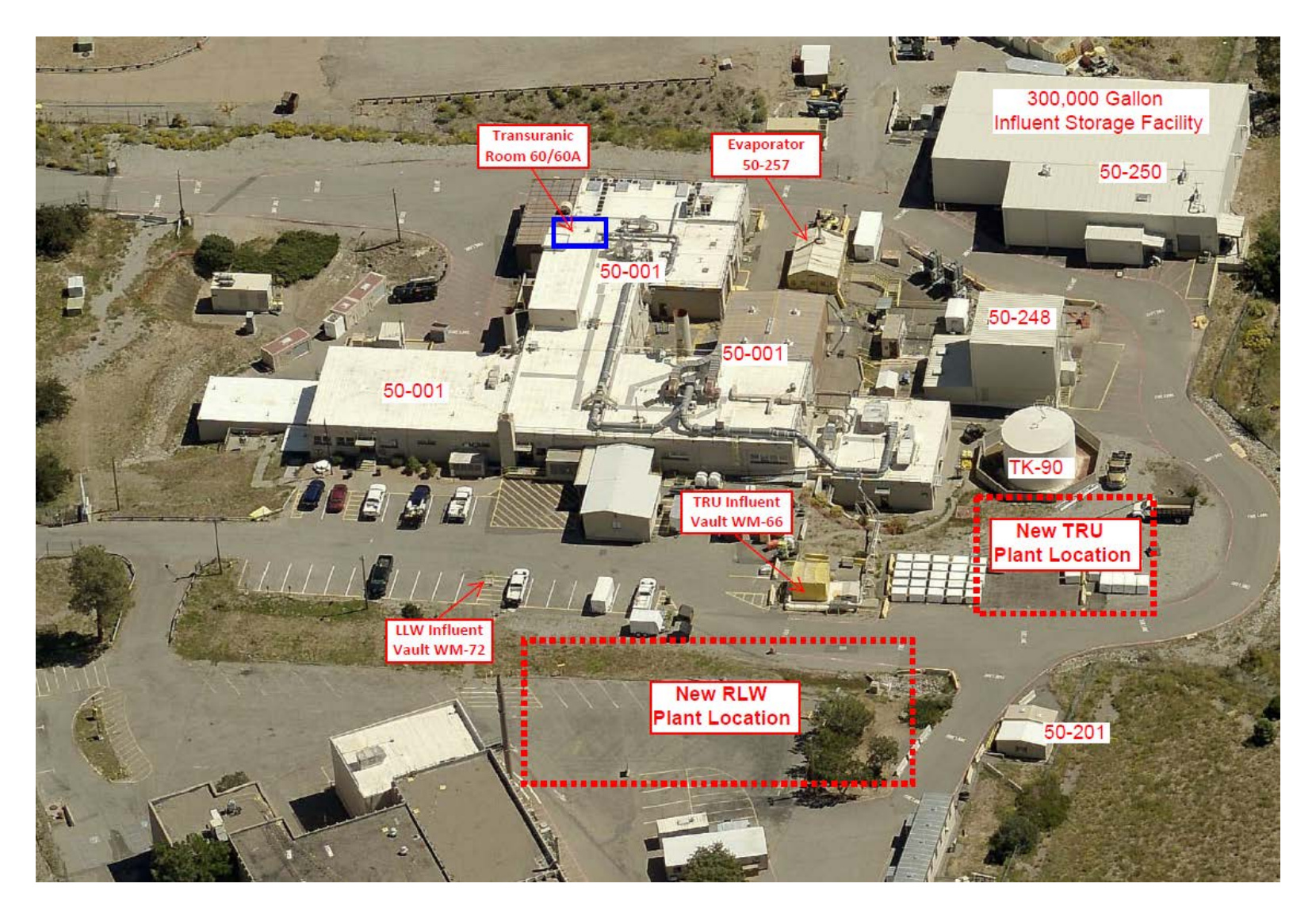
Figure 1. Aerial View Radioactive Liquid Waste Treatment Facility