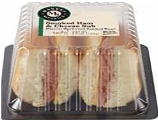
Market Sandwich – Smoked ham and cheese sub 1S9081,1S9099