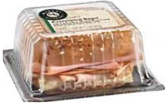
Market Sandwich – Everything bagel 1S9099,1S9252,1S9268