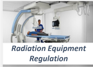
Radiation Equipment Regulation