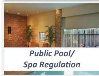
Public Pool/ Spa Regulation