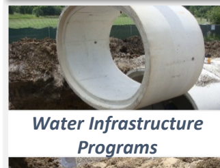
Water Infrastructure Programs