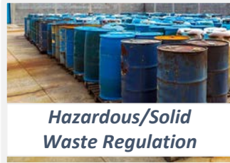
Hazardous/Solid Waste Regulation