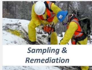
Sampling & Remediation