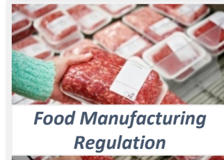
Food Manufacturing Regulation