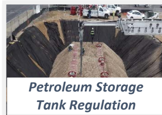
Petroleum Storage Tank Regulation