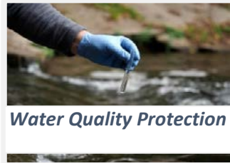
Water Quality Protection