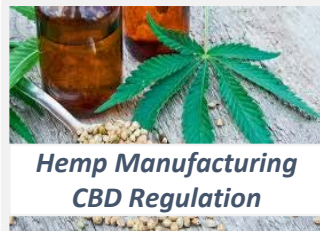
Hemp Manufacturing CBD Regulation