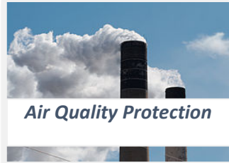
Air Quality Protection