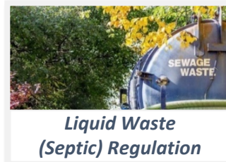
Liquid Waste (Septic) Regulation