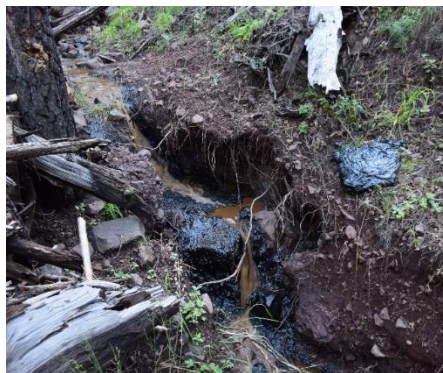
These images depict the same section of the creek before (top) and after (bottom) the cleanup.

On September 26, 2022, a tanker truck owned by R. Marley, LLC overturned on State Highway 15 in the Gila National Forest and spilled approximately 2,000 gallons of asphalt emulsifier into Jaybird Canyon. NMED learned of the spill on October 4, 2022, and took immediate action to investigate the site, identify necessary corrective actions to remediate immediate impacts from the spill, and communicate with the U.S. Forest Service (USFS), U.S. Environmental Protection Agency (EPA), and R. Marley, LLC about next steps. NMED's SWQB and the USFS oversaw the clean-up of the spill throughout October. However, rain hindered the clean-up due to high stream flows and saturated soils along the stream. In fact, October 2022 was the third wettest October on record (1895-2022) and reported a total of 6.19 inches of precipitation in the Silver City area!