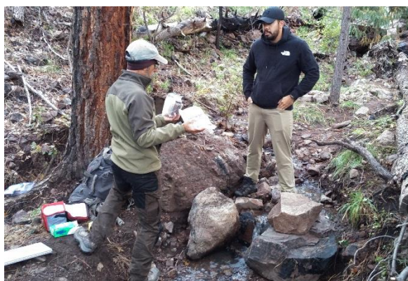
Sampling activity in Meadow Creek.

Once cleanup is deemed complete, the remediation/stream repair phase of the process will begin, which is expected to start in the spring of 2023. During this phase, R. Marley, LLC will focus on additional clean-up (if needed), stream repair and restoration (such as reseeding and rehabilitating or decommissioning trails), and water quality and soil sampling and analysis to confirm that cleanup and corrective actions were successful.