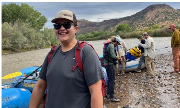
NMED staff Prepare to Push Off Near Buckman Landing to collect samples.

Staff from the DOE Oversight Bureau took to the water in October to collect spring, river and biota samples with DOE contractor N3B along White Rock Canyon. The annual event is required of N3B under the Los Alamos National Laboratory (LANL) Consent Order for the collection of water from springs discharging from the Pajarito Plateau to the Rio Grande downstream of Otowi Bridge and below LANL. The Bureau fielded a crew of four to observe, record, and sample the more than 20 springs between Buckman Landing and Cochiti Lake.