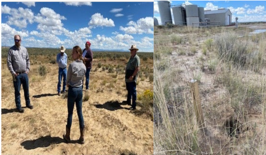
NMED and EMNRD staff in the field near Counselor, New Mexico in September 2022 to meet with Navajo Nation Chapter Officials concerning allegations of illegal dumping.