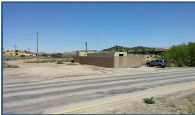
Pictured is a soil vapor extraction system at the Laguna Mart release site