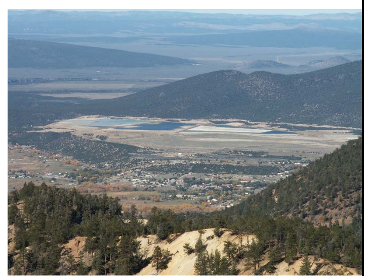
Village of Questa and Chevron Questa Mine Tailing Facility

The Consent Decree is a settlement agreement between Chevron Mining Inc. (CMI), the U.S. Environmental Protection Agency (EPA), and the State of New Mexico. Under the Consent Decree, CMI will perform part of the cleanup work described in the EPA's Record of Decision (ROD) and pay over $5.2 million to reimburse EPA's past costs for overseeing cleanup work at the Site.