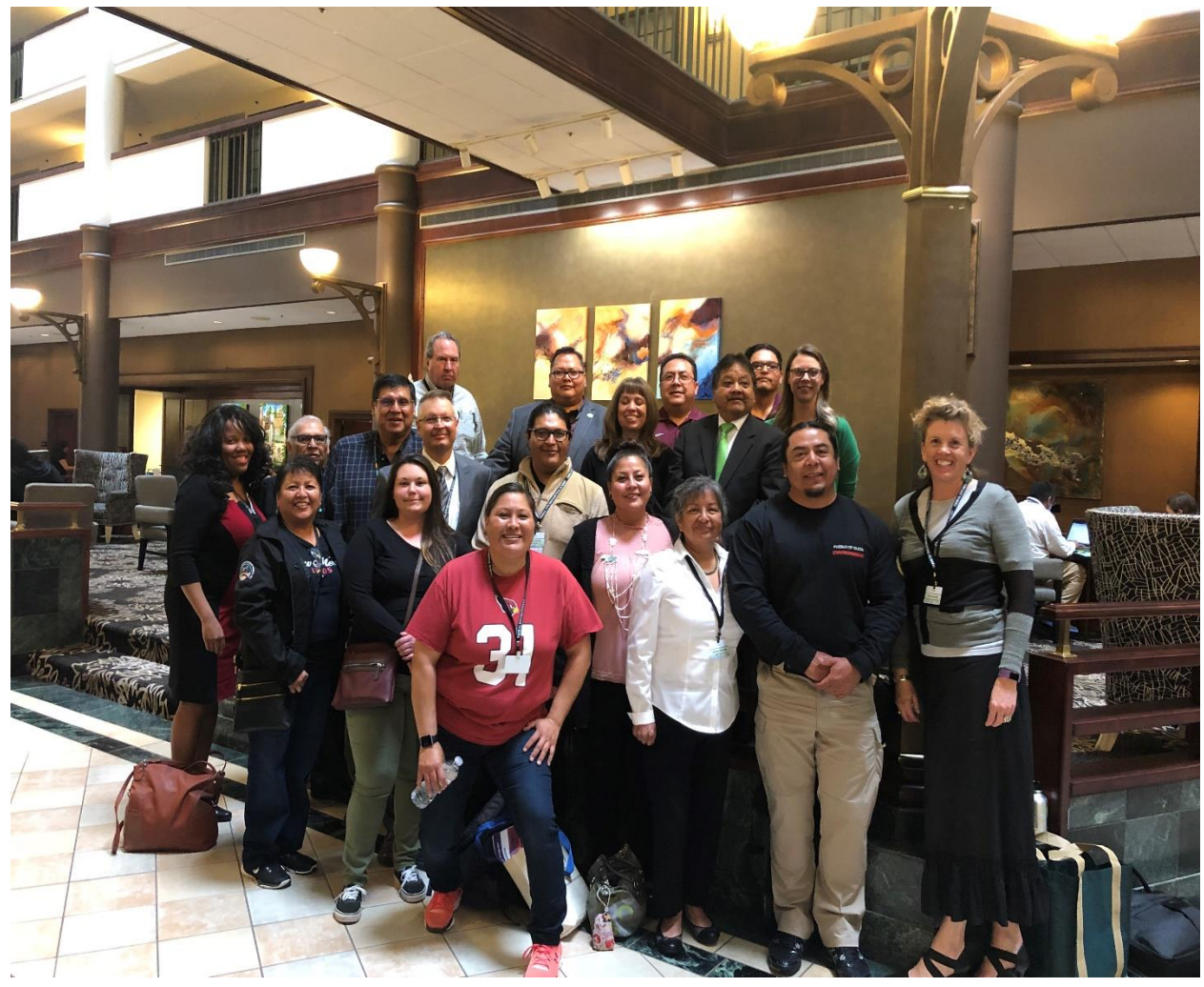
Photo credit: Region 6 Tribal Operations Committee Meeting in Dallas, April 2019, with NMED's Tribal Liaison in attendance