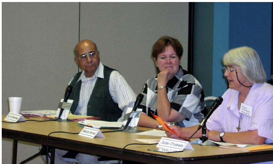
Mining, Hazardous and Solid Waste Panel