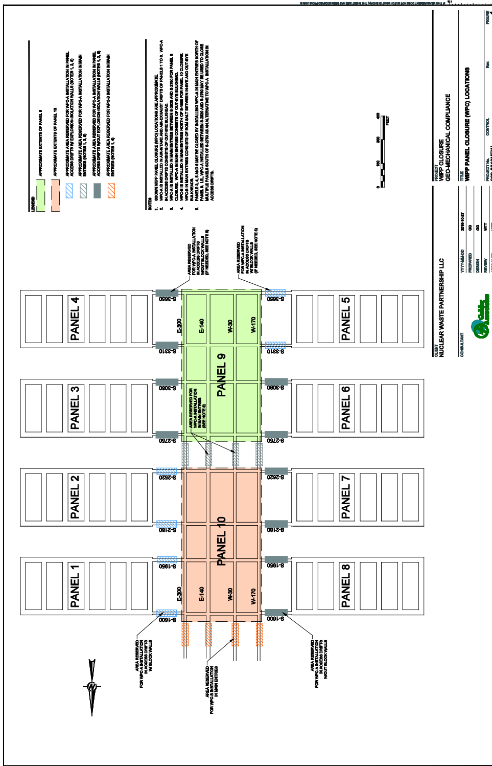
Figure G1-1 WPC Locations