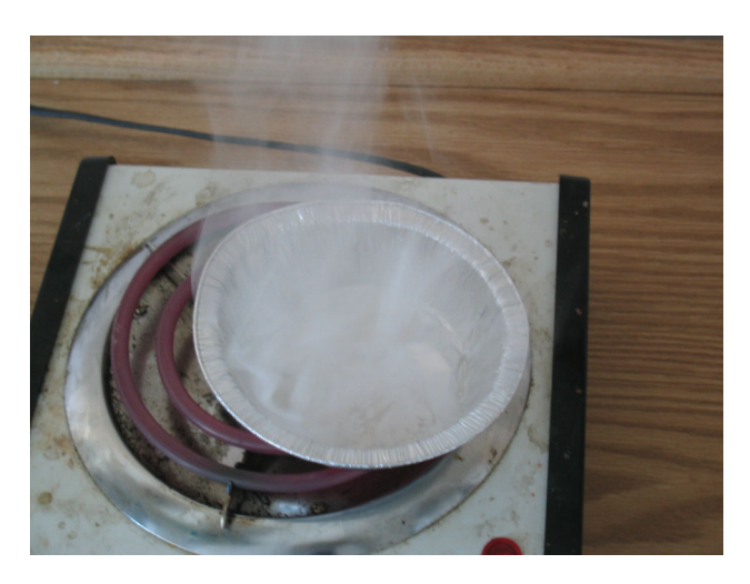
Figure 6. The setup for the 2000 mg "smoke" using the hot plate and an aluminum plate.

Figure 5. The sampling set-up for the "smoke" using the pipe showing the sampling setup.