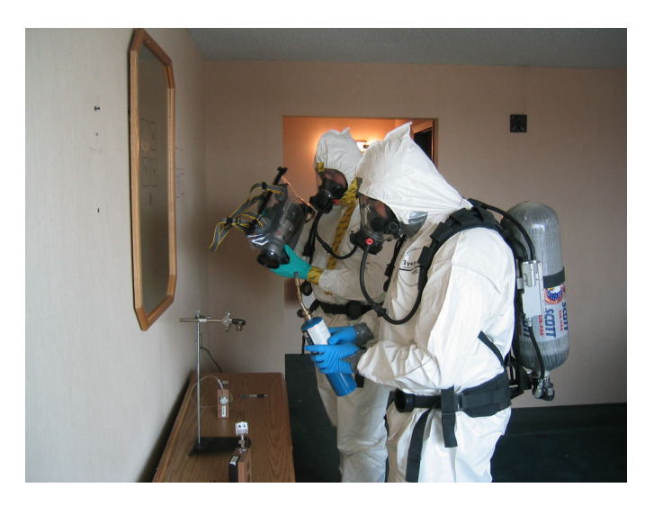
Figure 1. Location of the smoke generating area and the sampling location in the motel room.

Our simulated methamphetamine "smoking" study was conducted in a room of an abandoned motel that had been bought by the City of Thornton, CO. (Figure 2.) The motel room was similar to many other motel rooms in that it had a main sleeping area with a table, a closet area, and a bathroom area. The ceilings were approximately 8 feet high and the room was a total of 253 square feet. The cook was conducted on the table located in the sleeping area approximately midway along the west side of the room. The table height was approximately 30 inches from the floor of the motel room. The heater was operated during the sampling effort in order to warm the room and to provide ventilation. The heater was a simple unit ventilator located on the south wall of the room, next to the entrance.