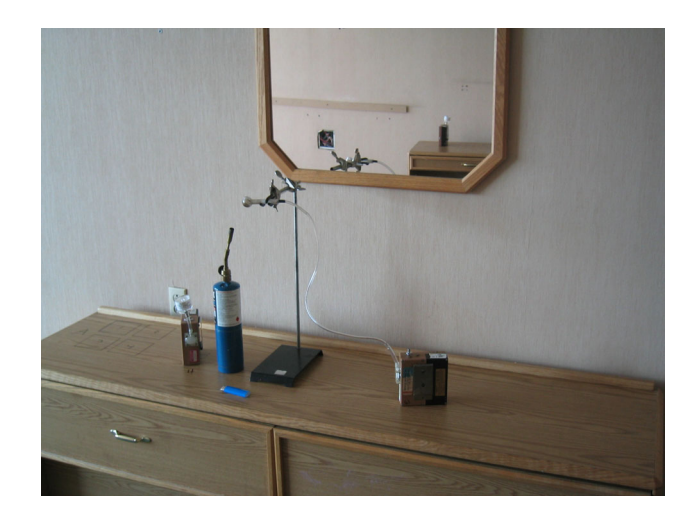
Figure 5. The sampling set-up for the "smoke" using the pipe showing the sampling setup.

Our methodology of "smoking" the methamphetamine was suggested by members of the North Metro Drug Task Force in Thornton, CO after interviewing drug users in the Denver Metropolitan Area . A total of four separate "smokes" were conducted in the motel room on the tabletop. The first two smokes consisted of using a methamphetamine pipe filled with 100 mg of methamphetamine. The methamphetamine had been manufactured in a previous controlled cook and had been analyzed by GC/MS and found to be 91% methamphetamine. This level of purity is considered to be higher than most "street" methamphetamine, which is reportedly less than 50% pure. The third "smoke" was conducted using the pipe and a 250 mg amount of methamphetamine. The fourth "smoke" was conducted using a hot plate with an aluminum plate holding 2000 mg of methamphetamine. The first two "smokes" were designed to provide information on the results of a large number of "smoking"sessions.