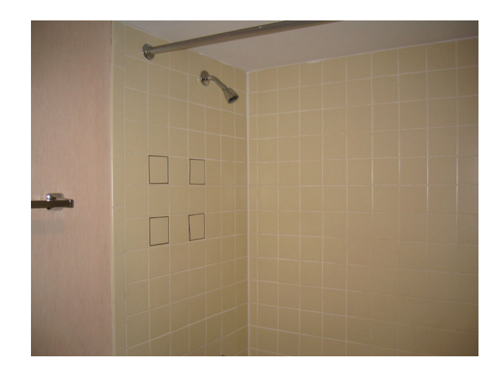
Figure 4. Vertical wipe sample location F located in Bathroom shower.

Figure 3. Horizontal wipe sample location D showing the 4 - 100 \text{ cm}^2 sampling locations.