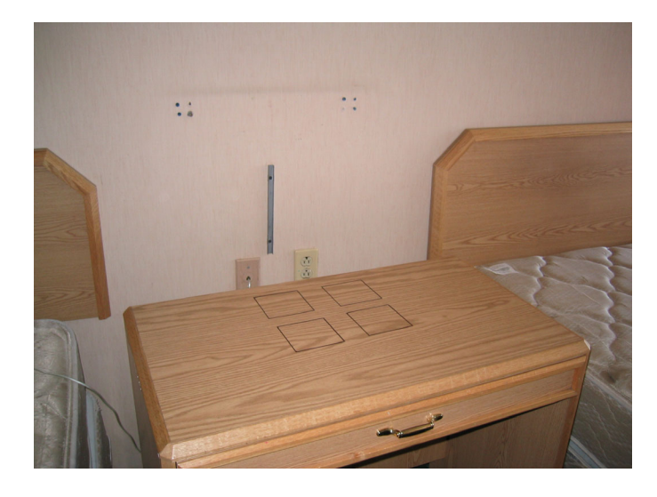
Figure 3. Horizontal wipe sample location D showing the 4 - 100 \text{ cm}^2 sampling locations.