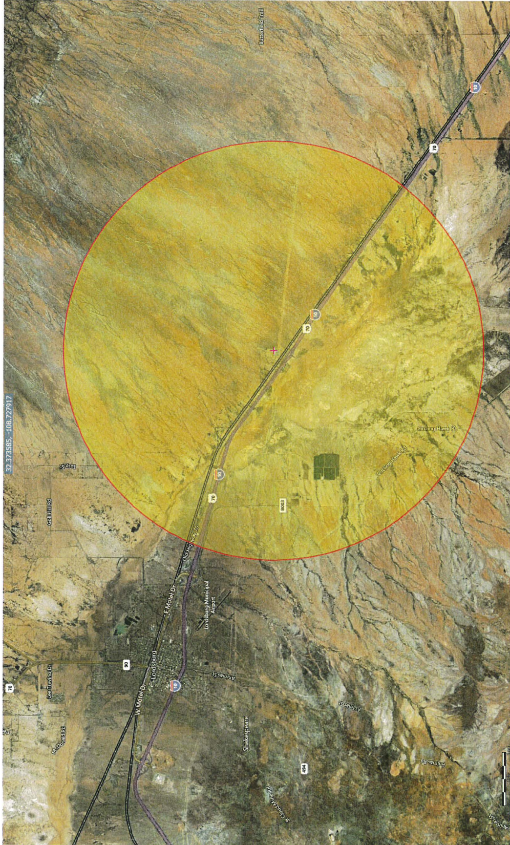
Lordsburg Compressor Station (w/ 4-mile radius drawn)