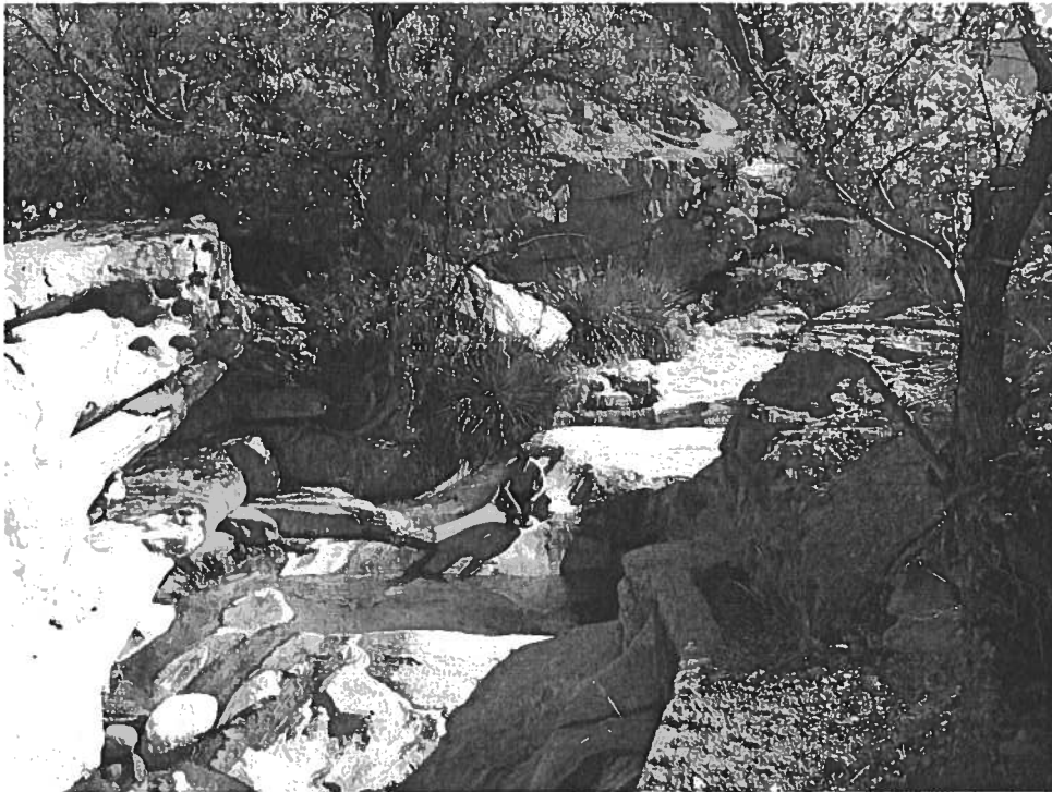
Figure 2. Perennial reach of Dog Canyon Creek at the Nature Trail