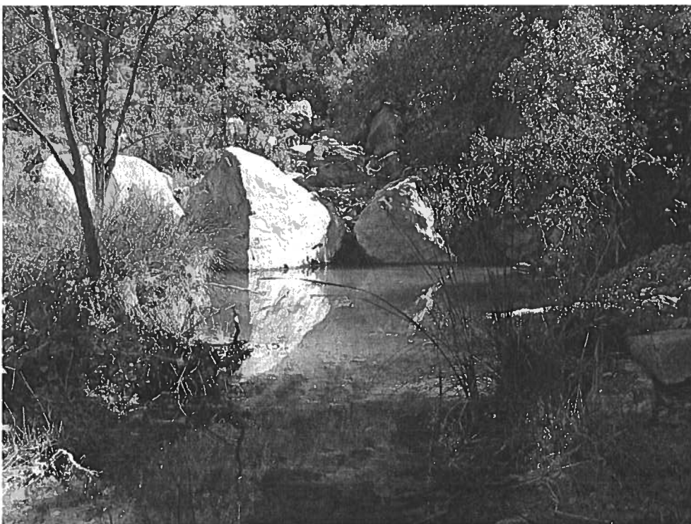
Figure 3. Perennial reach of Dog Canyon Creek at Line Cabin