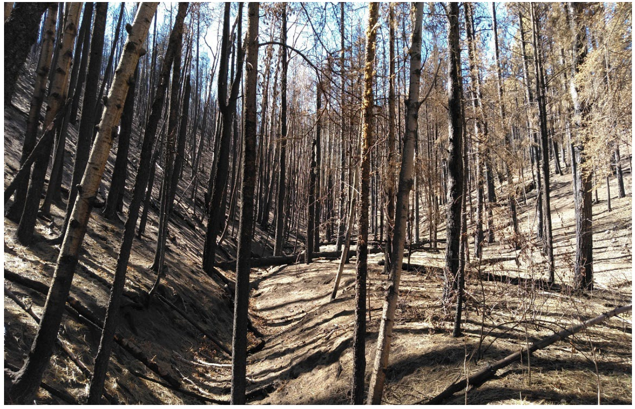
Figure 3. Burned Drainage to Rio en Medio