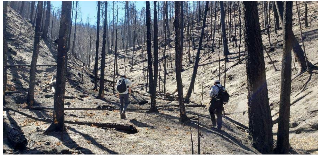
Figure 2. Rio en Medio Burn area