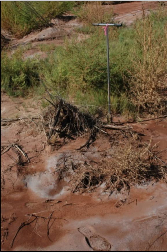
Figure 3. Recent fine debris deposited on the floodplain.