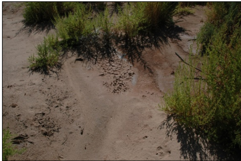
Figure 4. Soils cracks following the drying of recent sediment deposits.