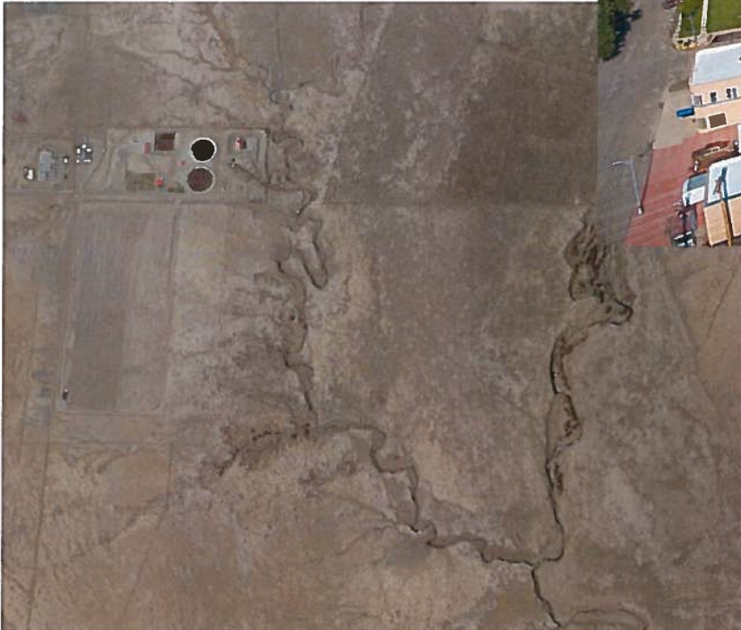
NMED ATTACHMENT 3

New Mexico Environment Department Surface Water Quality Bureau 10/1/2019