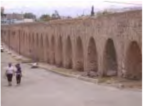
Historical aqueduct in Chihuahua City, Mexico built in the late 1700s and in use until 1982 for city water.

As we moved from the urban areas up into the mountains, new challenges arose. In the Sierra Tarahumara, a mountain range populated by the indigenous Tarahumara tribe, inadequate water supplies contaminated by inadequate sanitation were the most evident problems. Some of the problems seemed easy to solve, such as constructing a wellhead with a pump on a well that was just an open hole at ground level, being contaminated by runoff from a residential area. While we were discussing this at the well, a woman came to fetch water with a bucket on a rope. We asked her about the water and she said that everyone drinks it without any treatment such as boiling. Other problems were more