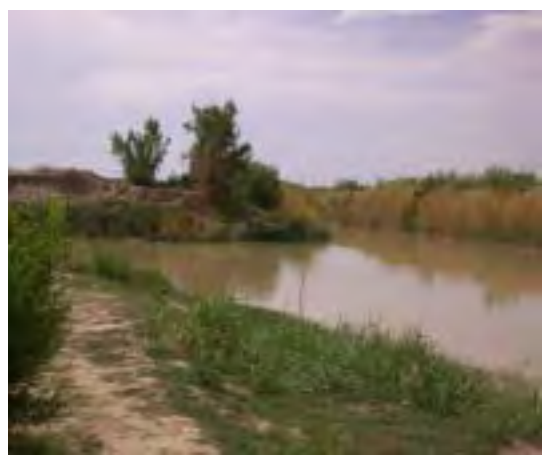
The confluece of the Rio Grande and the Rio Conchos in Ojinaga, Mexico.

building cross-cultural understanding by sending teams of young The professionals to other countries to meet the people and experience the Con Fer .