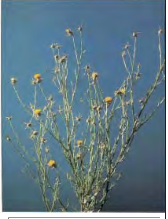
Yellow Star Thistle (Source: Weeds of the West, 1996)

The Surface Water Quality Bureau recently attended meetings focused on planning for a noxious weed control program in the Gila River valley To date, NMSU extension serviceí s Ron Lamb reports that heavy concentrations of star thistle in New Mexico have only spread as far east as the Cliff/Gila valley. Yellow star thistle is an annual, germinating in the fall or spring. Spreading of the seeds can occur from wind distribution and tracking by people, equipment, and animals, with viability being many years. The weed is a serious problem in California and Idaho; it has also been found in Grant, Catron, Eddy , Lea, San Miguel, and San Juan Counties here in New Mexico. Specific area concentrations of star thistle vary by year, depending on germination success, width of spread, and watershed management techniques in place. This plant is the main culprit for chewing disease in horses.