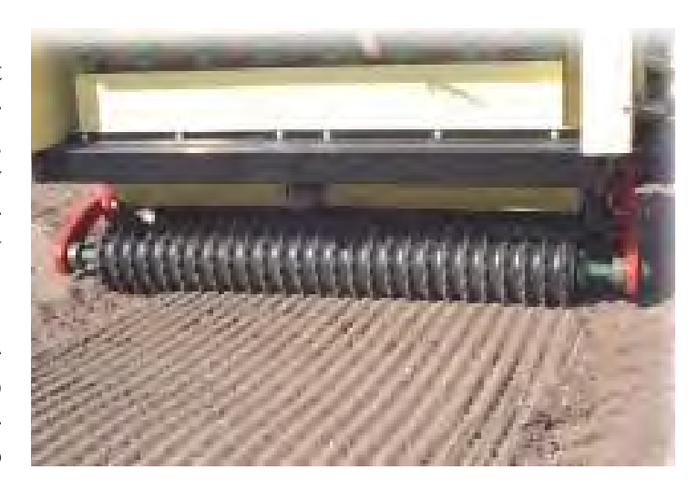
Cultipacker wheels used in preparing the seed bed.

to plant seed into a firm wet bed. The Brillion will be dragged over again to cultipack and firm the seed into the course sand. Dry fertilizer will be added before the last dragging of the Brillion to push the granuals into the seedbed.