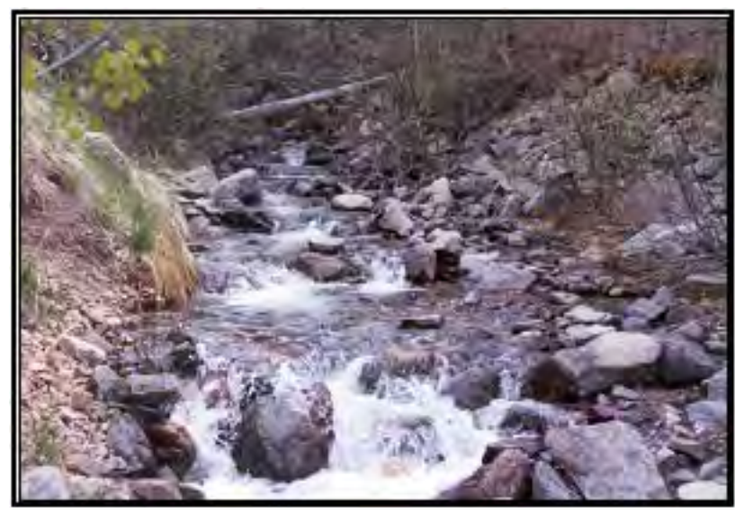
Rio Hondo near Taos Ski Valley

Initially there was speculation from the project officers that two groups might be formed for the Rio Hondo watershed, one at Arroyo Hondo and the other at VTSV, due to the long term mistrust that persisted between the two communities. However, during the meeting VTSV officials reached out