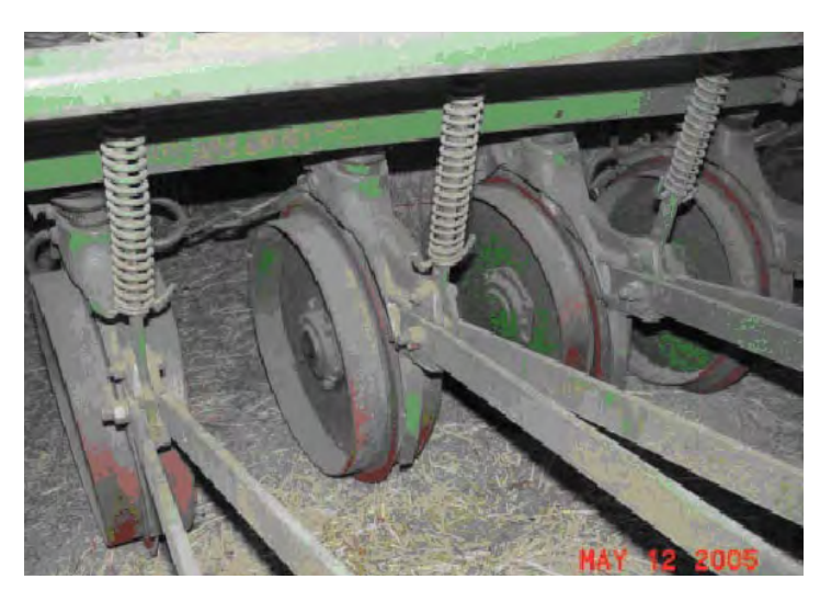
Old style drill with double disc openers insures of proper seed placement in loose sands

Due to the new seedbed material it was decided to replant using a drill that had double disc openers, to help insure seed placement at the required depths. The suggested plan at this time is to reirrigate prior to drilling to help settle the sand. We will then drag the Brillion drill over the wet seedbed to cultipack the material and add firmness, allowing the older style drill with disc openers