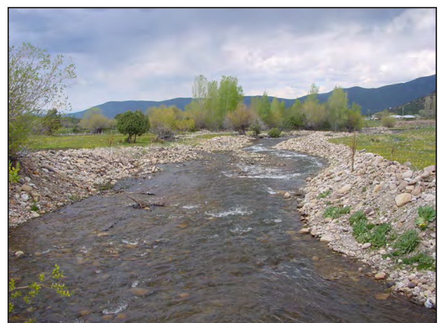
Rio Santa Barbara

EPA has accepted very few watershed-based plans to date. Until recently, the Plum Creek Watershed Protection Plan (http://pcwp.tamu. edu/wpp) in south central Texas, was the only example available in Region 6 of a plan that met the requirements. A long term effort by many agencies over approximately ten years was required to produce this plan, at considerable expense. The Plum Creek Watershed Protection Plan serves as a very valuable example for complex, urbanized watersheds including some in New Mexico. The relatively extensive monitoring and modeling used to produce the plan provided objective scientific information that was valuable in developing stakeholder consensus on fair and effective solutions.