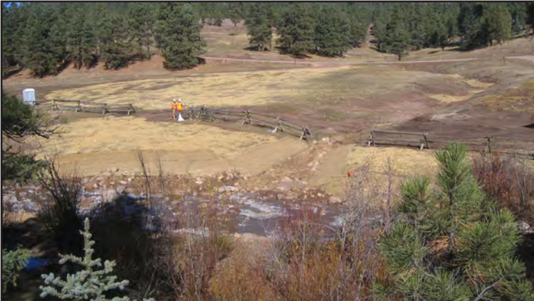
Beaver Pond immediately after spill (above). Beaver Pond and drainage after remediation (below).