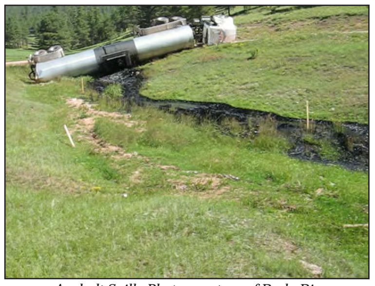
Asphalt Spill.

When an incident like this occurs, there is a response process. there is any danger to the public, a perimeter will be established by the Department Public Safety (DPS). In this case, NM Highway 126 was closed and emergency personnel were engaged. The DPS notified the NMED Hazardous Waste Bureau and the Surface Water