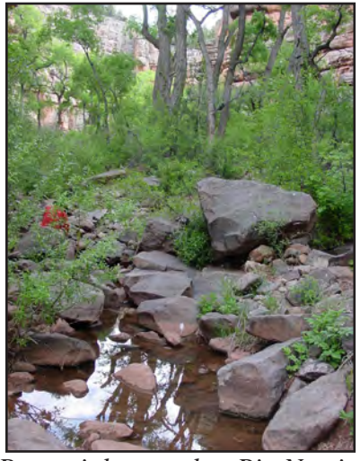
Perennial example - Rio Nutria Zuni Watershed

SWQB has released a revised version of the Hydrology Protocol, a technical document developed to distinguish between ephemeral, intermittent and perennial streams and rivers in New Mexico. Such determinations are often key to applying the appropriate water quality standards to a waterbody. The protocol relies on hydrological, geomorphic, and biological indicators of the persistence of water. These characteristics are then ranked using a weighted, four-tiered scoring system for an objective, practical scoring mechanism. The protocol can used to provide technical support for a use attainability analysis (UAA), or to identify unclassified waters within an otherwise classified segment. However, the protocol is designed solely to aid in water quality standards determination and the resulting determinations have no bearing on water rights or other non-SWQB programs.