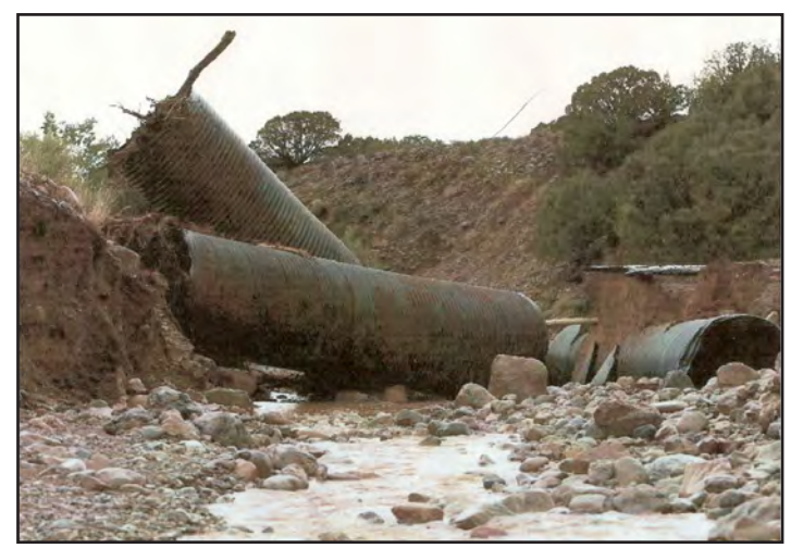
Flood damage on Las Huertas Creek, July 2006

or homes. During the summer rainstorms, extreme events can lead to downcutting of the river bed - without accessing its floodplain it has nowhere to release its energy except downwards. Such was the case determined by the Las Placitas Watershed Association when in 2006 they applied for and were awarded a Clean Water Act (CWA) Section 319 (h) "on-the-ground" watershed restoration project.