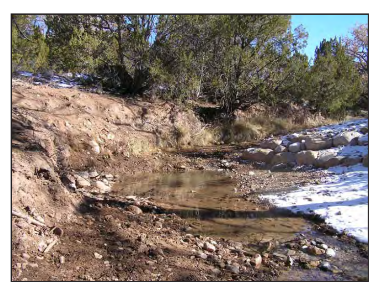
Restoration of deep downcut gully and back-eddy area at Van Driessche/Bladergroen property boundary – (view upstream). Note baffle installation on right and restoration of floodplain.