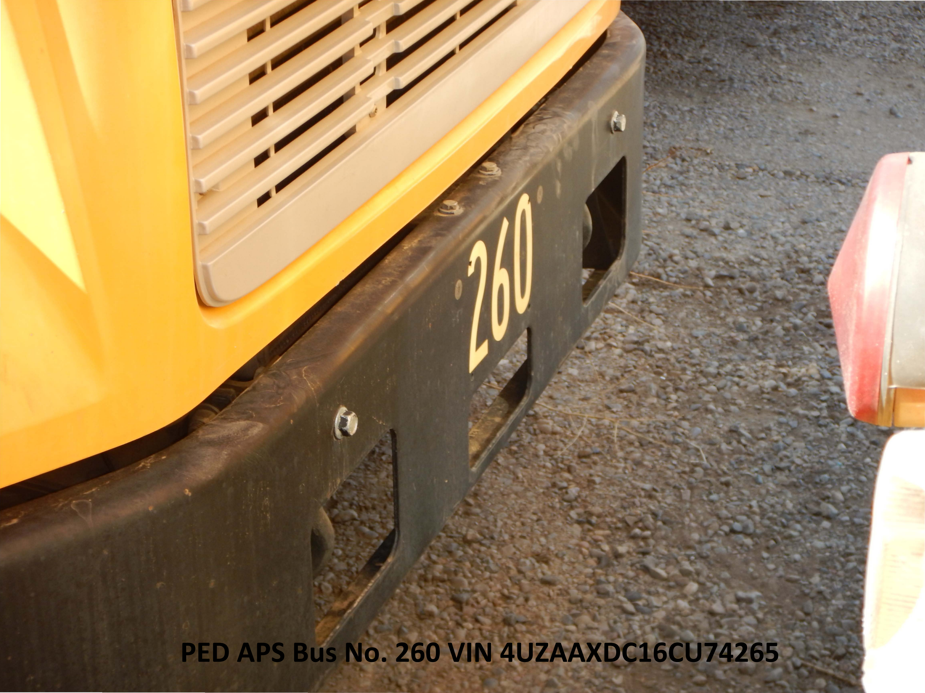
PED APS Bus No. 260 VIN 4UZAAXDC16CU74265