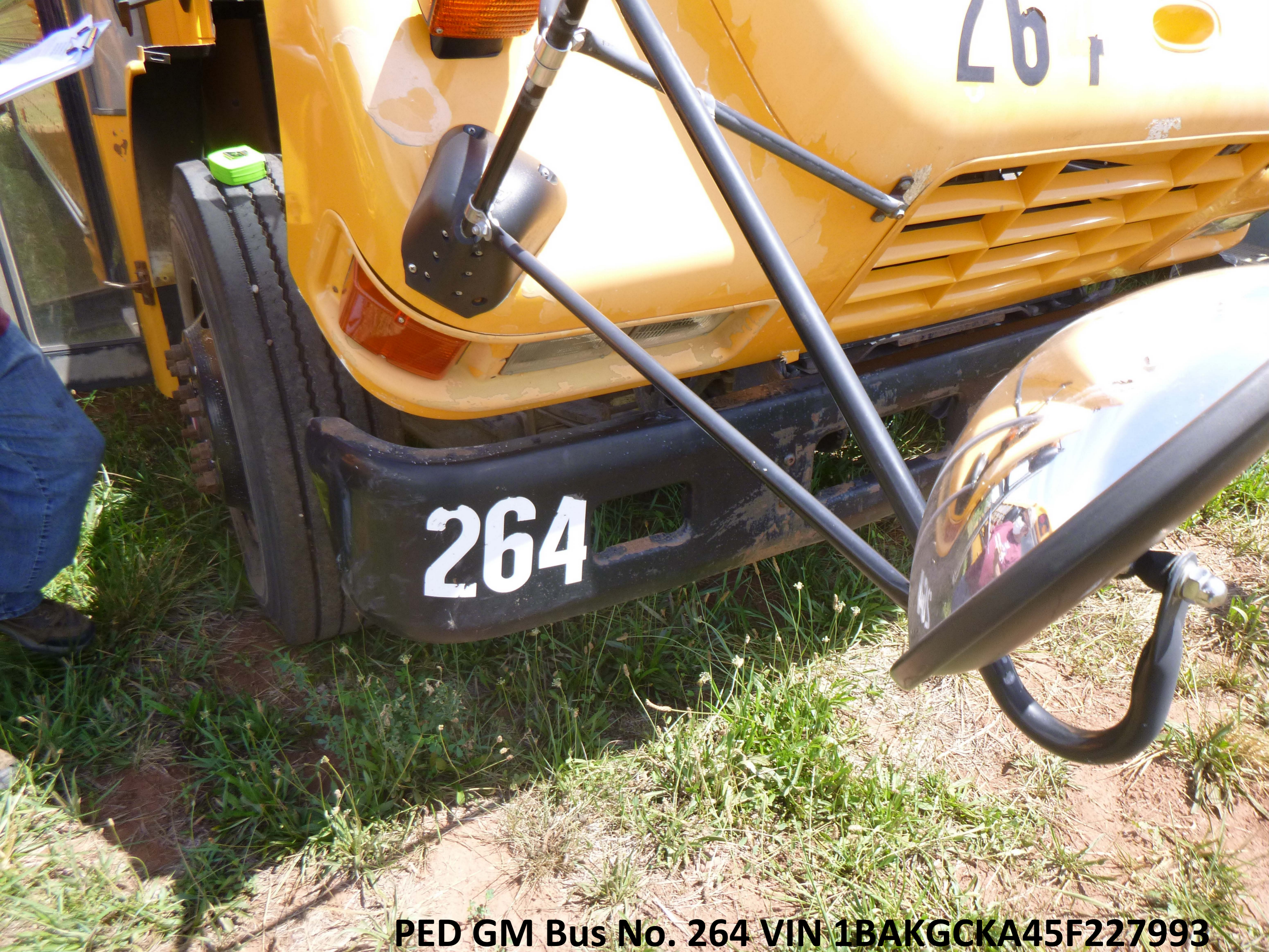
PED GM Bus No. 264 VIN 1BAKGCKA45F227993