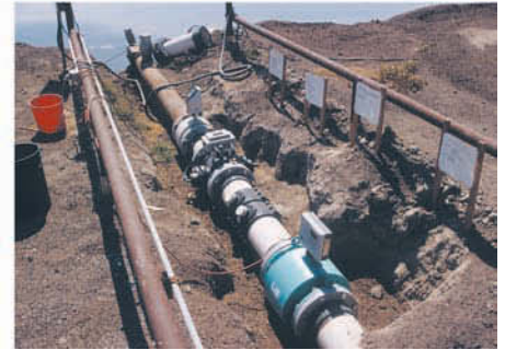
Several different types of flow meters were tested for accuracy and ease of use in dairy manure ponds. Left , The Doppler meter sensor is attached to the side of a PVC pipe. Above , A tube electromagnetic flow meter is installed in a PVC pipe. Top right , Insertable electromagnetic flow meters were accurate in tests; they are most useful if the meter needs to be moved from site to site. Right , The flow meters were tested in series. Dairies may realize significant savings in fertilizer costs by investing in a Doppler or electromagnetic flow meter.

because manure solids and debris in the water collect and clog many flow meters. The propeller meter, widely used for measuring flow rates in other agricultural applications, is also susceptible to weeds and twine entangling the propeller. In fact, any flow meter that extends into the flow path of the pipeline is likely to experience the same problems. Alternative methods of estimating manure-water flow rates, such as measuring the rate of drop in the manure pond or estimating flow rates from assumed pump discharge, have their drawbacks. Pond drop measurements are complicated by the difficulty in determining the actual surface level of the pond and by inflows potentially occurring at the same time as discharges. The discharge rate of some manure-water pumps, such as floating agitator pumps, may vary widely depending on the level of the manure pond. As a belowground pond is emptied, the pump discharge rate drops. The pumping rate of one manure-pond pump dropped from 1,200 to 800 gallons per minute (gpm) when the pond surface fell approximately 5 feet.