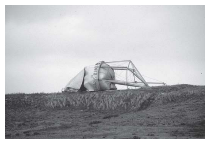
A water tower that has exceeded its useful life!

The worksheets and other information in this guide will also help you begin to develop an overall strategy for your system. Using this guide along with EPA's "Strategic Planning: A Handbook for Small Water Systems" (EPA 816-R-03-015) will help you develop, implement, and receive optimal benefit from an asset management plan that fits in with your system's overall strategy.